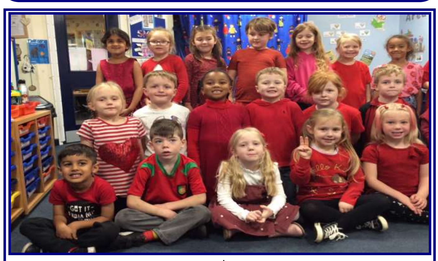
Base 5 lovely smiles for show racism the red card