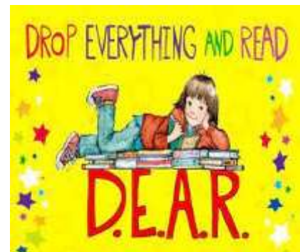
Year 4 pupils enjoying Dear time with their parents.