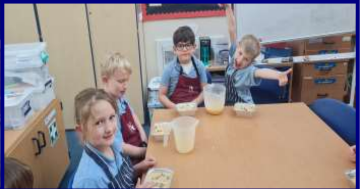
Well done to cooking club, they are very enthusiastic!