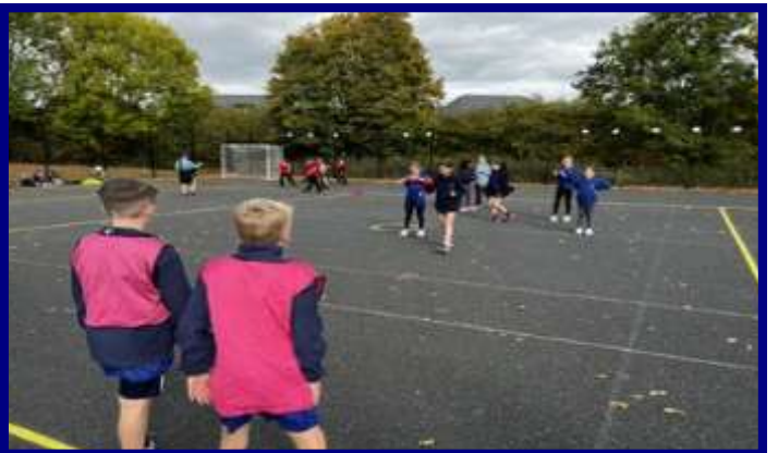
Our Yr6 had a great time at Charlton School taking part in Quidditch.