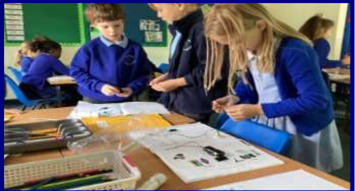
Year 4 have had a super time in class learning about electrical circuits. We learnt about the different components needed and drew our own diagrams using symbols.