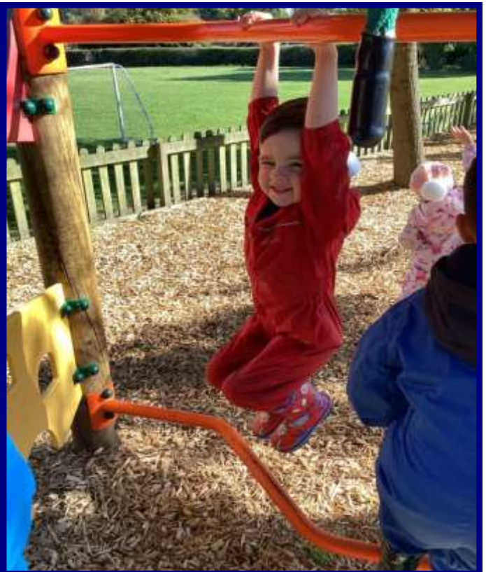
Reception explored the Trim Trail for the first time. .