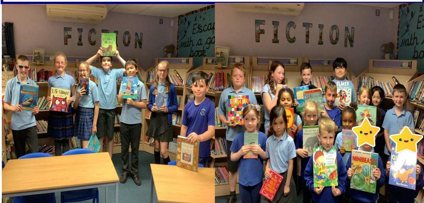
This week's Star Reader award children have not only received their certificate and bookmark and taken part in a celebration story time, but they have also been able to choose a book – kindly donated to school – to keep as a reward for their efforts with their reading.