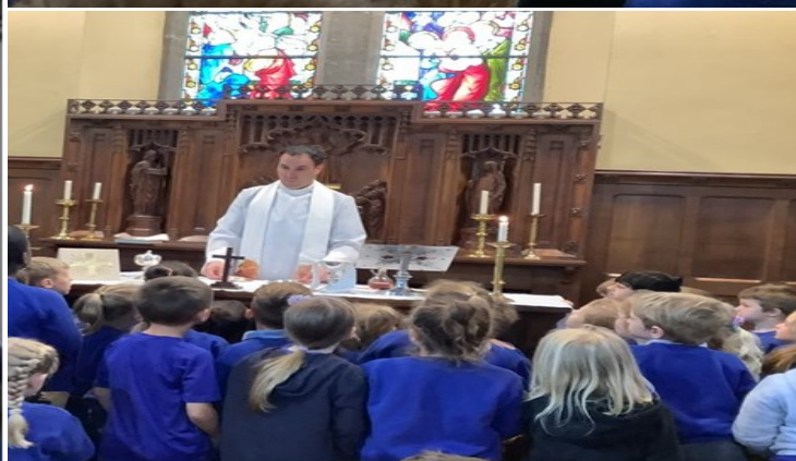
Year 1 had a very enjoyable visit to Holy Trinity Church this week.