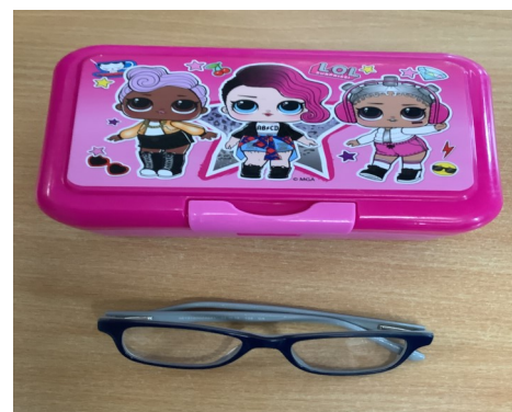
Please collect from school office if they belong to you.