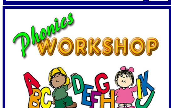
Year 1 Parents are invited in on Thursday 30th January come and find out more and help support your child's learning